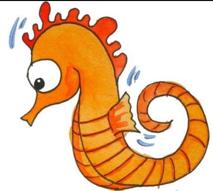
CABALLITO DE MAR